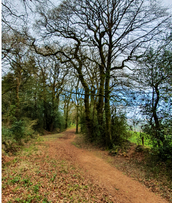
4. The bridleway along Whitedown Copse

5. You will come to a gateway with a map explaining that you are now continuing along a permissive footpath. (Permissive footpaths are agreed with a landowner for use by the public and are usually closed for one day in a calendar year to prevent it from becoming a statutory right of way.)