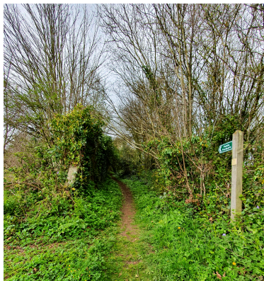
10. The start of the field side footpath in Hele