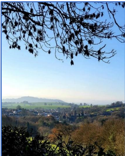
Above: The view from Strawberry Hill. Right: detail from John Owen's Map, 1573: see route guide 12.